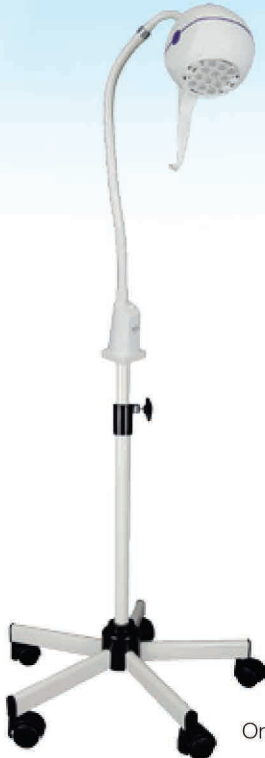
On heavy trolley base (1)

A second switch on the lamp head allows the brightness to be adjusted: 50 % / 100 % (option).